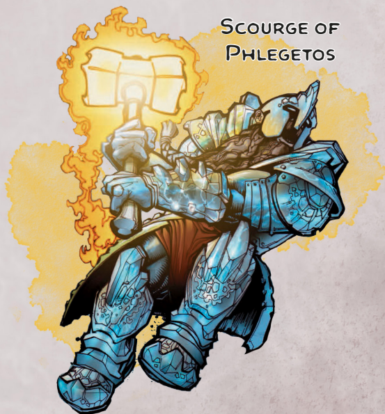
SCOURGE OF PHLEGETOS

Hells. While you carry this hammer, you can use a reaction to cast hellish rebuke (spell save DC 13). Once used, this property can't be used again until the next dawn.